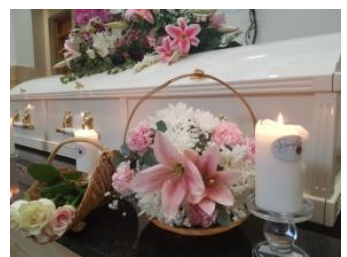
White cremation Albatross

The silk flowers provided are the same as displayed in the images of the coffins