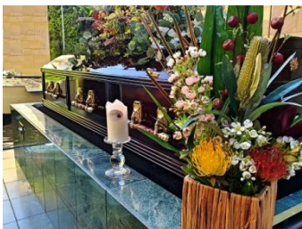
Rosewood cremation Albatross

Professional Service Fee: $4999.50* Includes GST