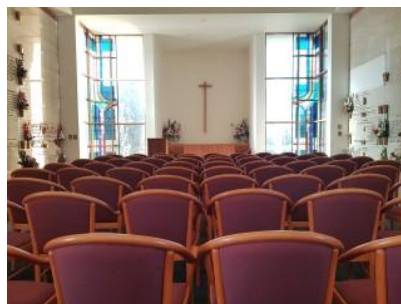
depicts the chapel complex