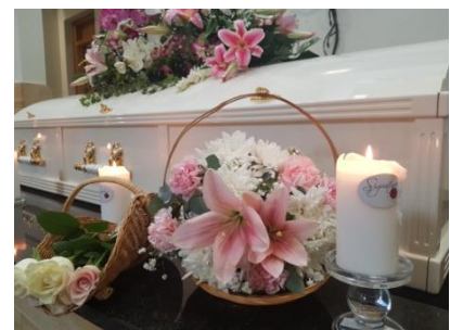
White cremation Albatross

The silk flowers provided are the same as displayed in the images of the coffins