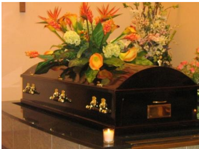
Rosewood cremation Albatross