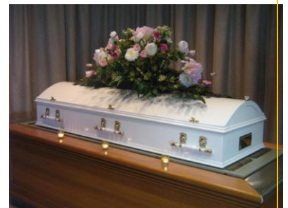
White cremation Albatross

The silk flowers provided are the same as displayed in the images of the coffins